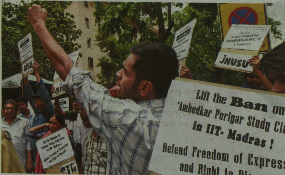
Joining forces Protestors in Delhi and (bottom) Bengaluru express solidarity with members of the Ambedkar Periyar Study Circle in IIT-Madras after it was de-recognised recently.