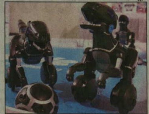
MiPosaur — a robot that can chase after a ball, go for a walk with its owner and even dance and make happy sounds — is displayed during a tech show in New York

Pivac will now work to commercialize the robot, one of its first kinds globally. THE INDEPENDENT